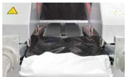
The Logi Wrap 800: space saving, flexible and powerful